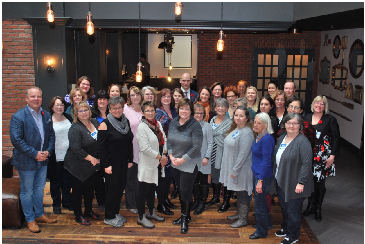
CCCF National Affiliate Meeting in Ottawa with Minister of Families, Children and Social Development, Jean-Yves Duclos

membership growth and engagement, hiring a Bramm and Assocaites, to help guide and lead the work, on organizational growth, development and member engagement to better serve our collective members.